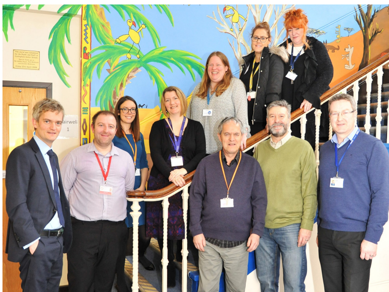
Representatives of tenant organisations at Sanford House