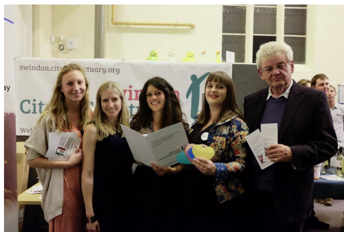
Swindon City of Sanctuary Launch Event, October 2016

Secondly, I've been very pleased by our work in Equality and Access. Our campaign work in this area has now got considerable traction and the City of Sanctuary, More in Common and Swindon 200 initiatives have generated widespread interest and high levels of engagement. Around 400 people have been directly involved in these campaigns – many more indirectly. The work, naturally, is ongoing, but working in partnership with other local community groups, charities and businesses, we're helping to make Swindon an even more inclusive and equal place.